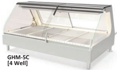
GHM-5C [4 Well]