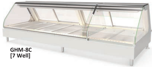
GHM-8C [7 Well]