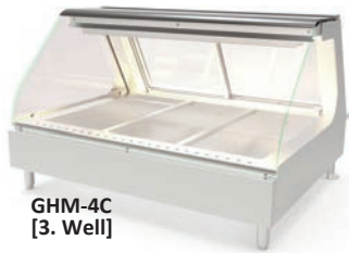
GHM-4C [3 Well]