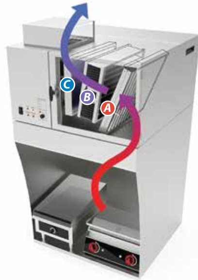
Model GVH-C Provides effective, three-stage cleaning in a space-saving countertop package.