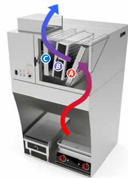
Model GVH-C Provides effective, three stage cleaning in a space-saving countertop package.